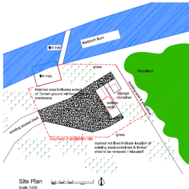
Figure 2 – Site Plan