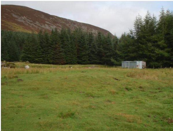
Photo 1 - View of existing site